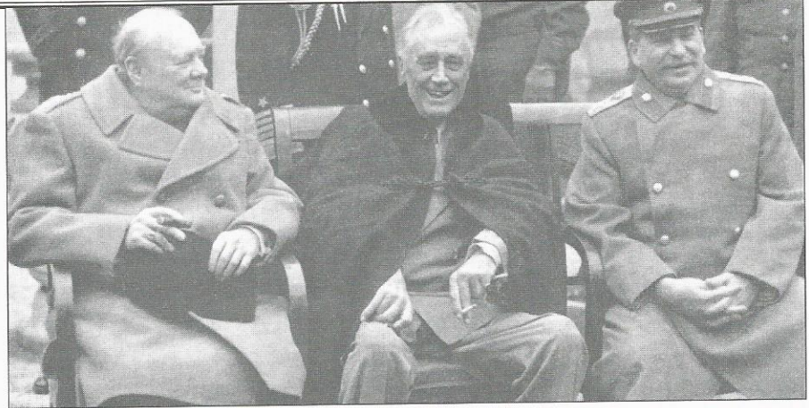
The three Allied leaders – Winston Churchill, Franklin Roosevelt, and Joseph Stalin (left to right) – sit for photographers at the Yalta Conference, February 1945. FDR died two months later.

The chief Allied leaders (Franklin Roosevelt, Winston Churchill, and Joseph Stalin) met in the Crimean resort city of Yalta (in the Soviet Union) in February 1945. Roosevelt and Churchill agreed to recognize pro-Soviet governments in each of the